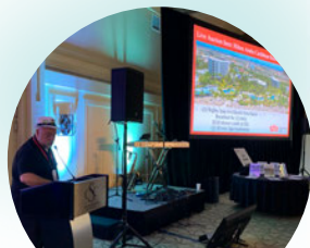
Audio / Visual

Showcase your talent in front of those with the power to book you for groups! We are on the hunt for DJs, local musicians, photo booths, performance artists, games, and all other genres of experiential entertainment!